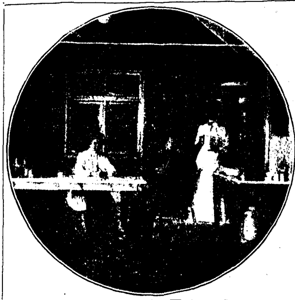
LADY DOCTOR WITH PATIENT IN DISPENSARY, PADDOCK WOOD.

At Paddock Wood, where the immigrants numbered 10,000, a lady doctor and two nurses attended to sickness and accidents, and an illustration on this page shows the doctor in the dispensary with a patient. The doctor and nurses paid